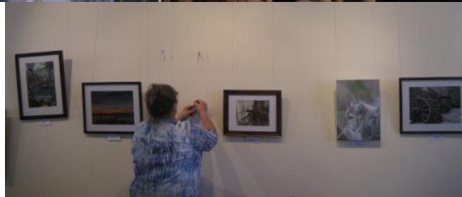
Above: Booking in and hanging in the Gallery

MANY THANKS TO ALL VOLUNTEERS ASSISTING THROUGHOUT THE ART SHOW!