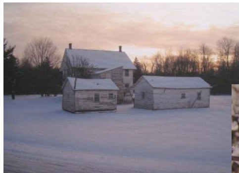
Two more photographs from the KIDMAN ROTARY ART SHOW PHOTOGRAPHIC CATEGORY

Exhibitors are reminded that help with hanging is required at least once each year. Please take your turn!