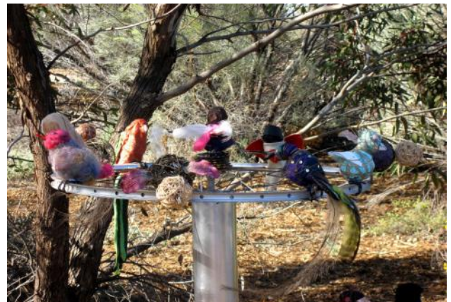
ABOVE: Part of the Curdnatta Art Group's found-object/fibre sculpture, "Endangered" in the Arid Sculptural Ex.(Aust. Arid Lands Botanical Garden)

With many more exhibitions, markets, workshops and events planned for the Festival, it would have been nice to have more time to spend (Besides, the weather was glorious!) Ed.