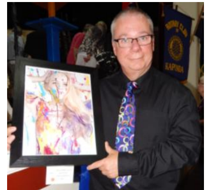
Pictured Above - Photographer KEN LYONS who was the judge of the Photographic Section for Best Photograph holding the winning photo “Splatter” by EMILY WILLIAMS .