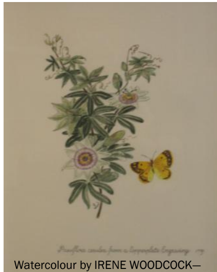
Watercolour by IRENE WOODCOCK—

[This will be the FINAL NEWSLETTER sent for those who do not renew before 15/4/2013.]