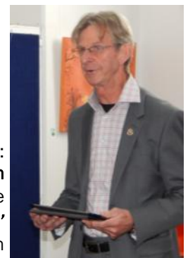
Pictured right: Mayor Bill O'Brien opening the ‘ New Beginnings ’ Exhibition