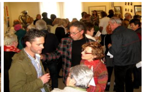
IMAGES FROM THE OPENING CELEBRATION