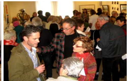
IMAGES FROM THE OPENING CELEBRATION