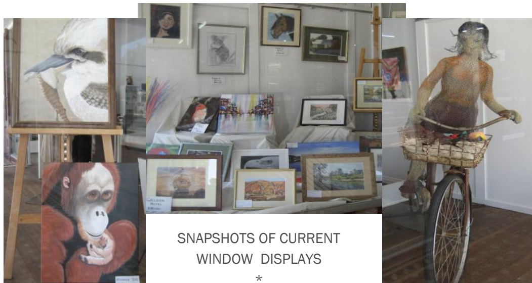
SNAPSHOTS OF CURRENT WINDOW DISPLAYS