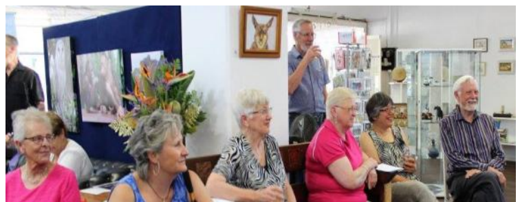
A portion of those attending.