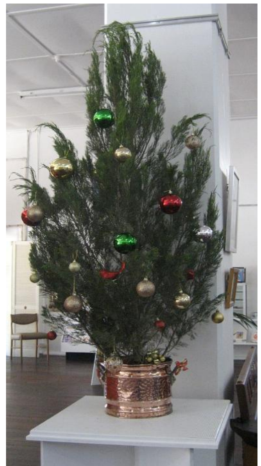
KCG's beautiful 'living' Christmas Tree welcoming visitors to the Gallery this year!

All this will take place WED. 14 OCT. to THURS. 22 OCT. 2015.