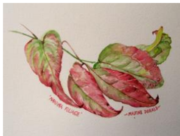
Left: “The Colours of Christmas” (Nandina Foliage) Small watercolour by MAXINE DONALD.

IT IS ALSO OF PERSONAL BENEFIT TO EVERY ARTIST TO PHOTOGRAPH EACH ARTWORK AS IT IS COMPLETED as a ready “PORTFOLIO” to show galleries if requested and for one’s own record of ‘progress’. IT IS A GOOD HABIT TO GET INTO and “TOO LATE” after the work has been sold!