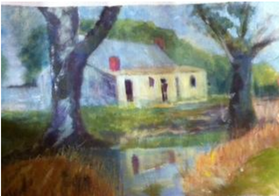
Barb Zwarts painting from the workshop