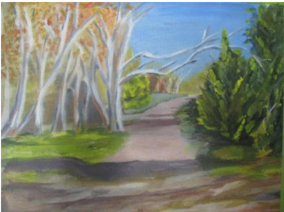
Anne Patterson’s painting from the workshop