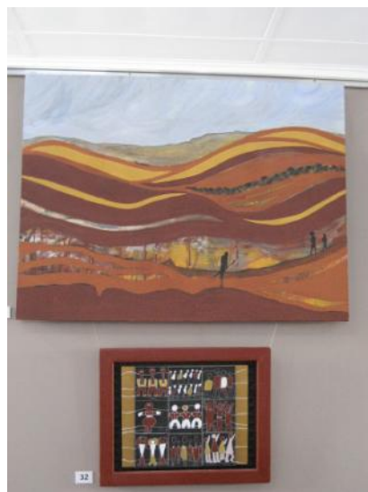
Pictured above: Two of Val Surch's works