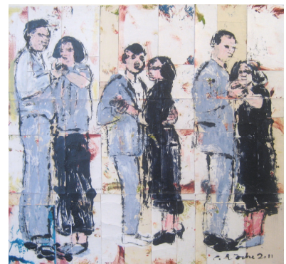
CHRISTIN VOCKE’s “DANCING CLASS 2”