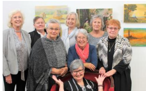
Left: Some of the artists who took up the challenge—