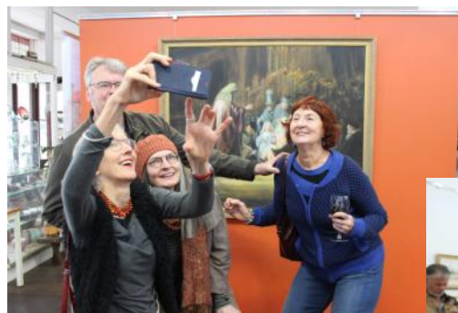
Left: Technology appears throughout the exhibition, as it did for attendees!