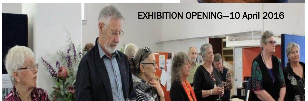
EXHIBITION OPENING—10 April 2016