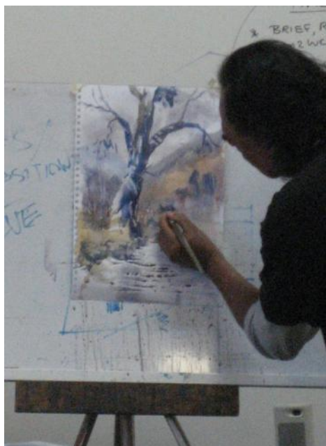
ALAN'S WORKSHOP photos

The committee is happy to arrange a presentation for businesses and community groups.