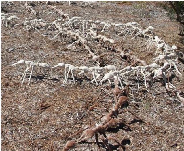
ABOVE: Photograph of Kirsten’s Bio Plastic “Ants” an installation in the Pt Augusta Arid Lands Garden Sculpture Exhibition in 2014.