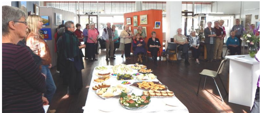
Pictured are some of our many amazing volunteers who joined us for afternoon tea on Sunday 12th April. More photos can be found on our Facebook page.

On Sunday 12th April KCG held an afternoon tea for GALLERY ATTENDANTS, as a way to say thank you for all they do. It was also a nice way for everyone to meet each other and have a chat over some good food and drinks. A big thank you to ALL who volunteer, it is very much appreciated.