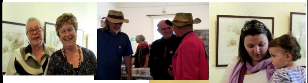
New and known faces at the Opening!

With an unforeseen ‘Opener’ malfunction Mal declared the Exhibition officially “Open”!